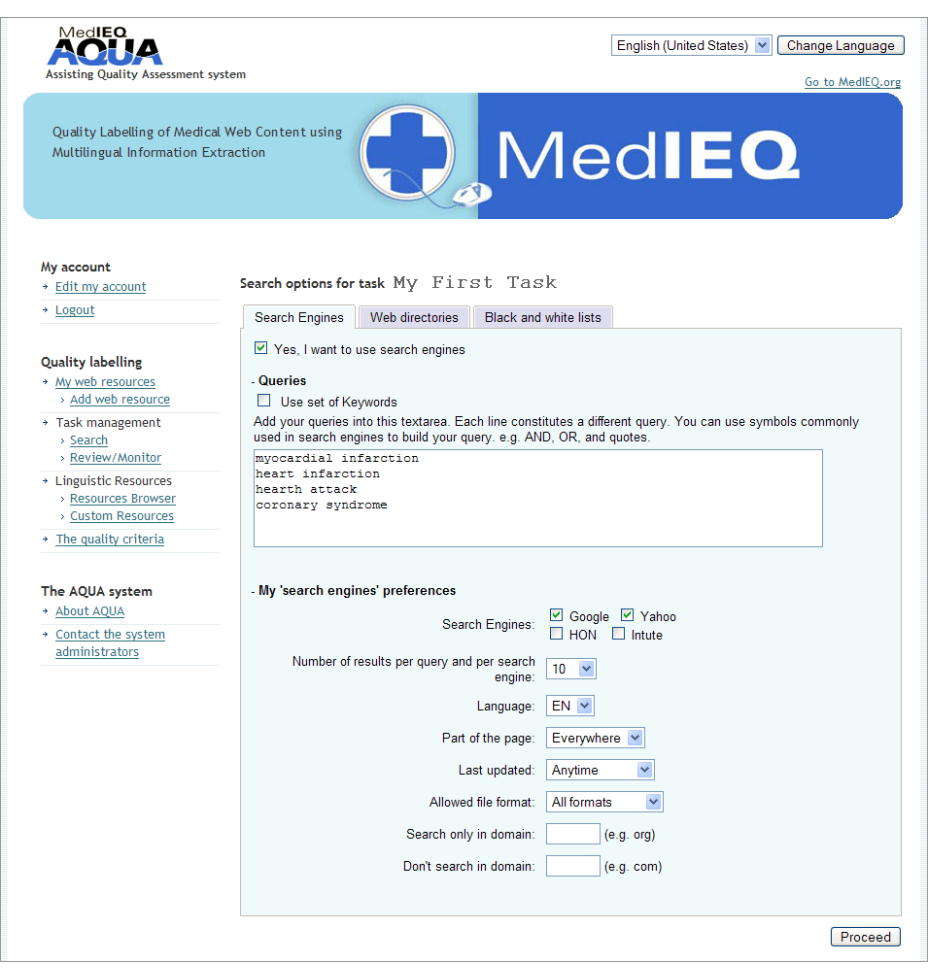
Figure 3. Configuring the MedIEQ Crawler from the AQUA interface

The crawling process becomes even more focused with the aid of a content classifier , inductively trained to distinguish health content from non-health content. This classification component visits every URL from the merged / filtered pre-final URL list and checks its contents, thus filtering out some more entries.